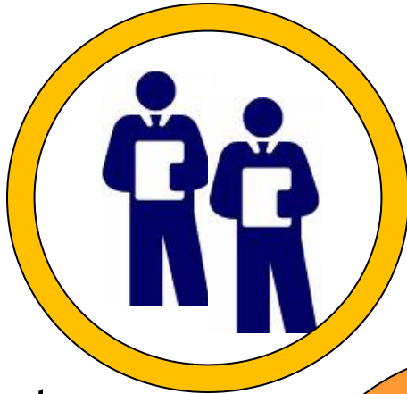
Academic team (Knowledge Base)